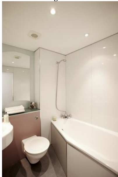
Modern main bathroom