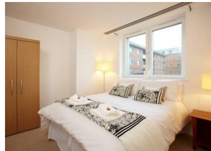
Spacious second bedroom