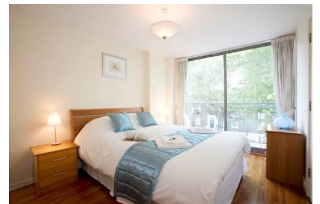
The Waterloo Apartment bedroom