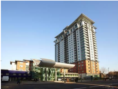
Prestigious apartment block