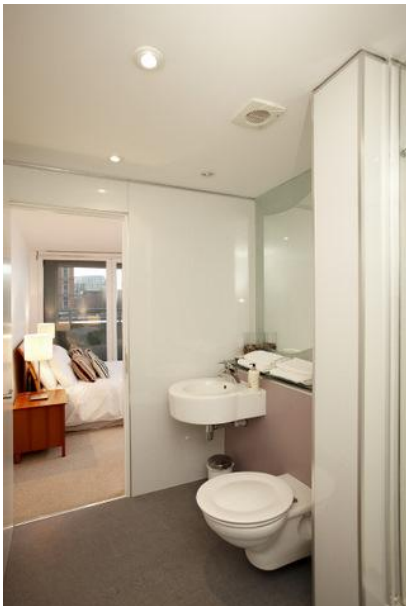
Ensuite bathroom with shower