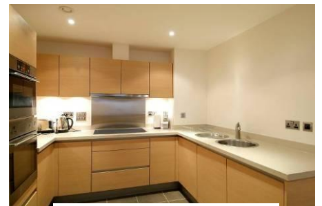
The St James' Apartment Kitchen