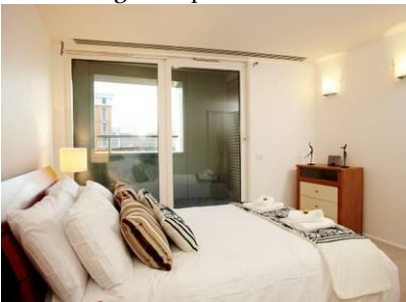
Master bedroom with ensuite